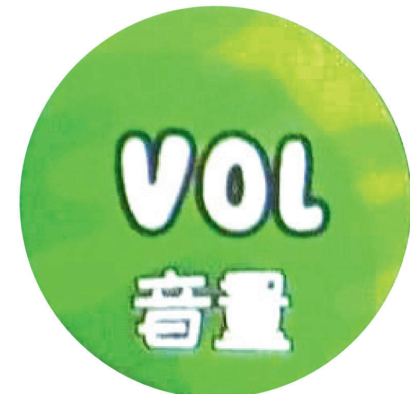
Adjust Volume +/-