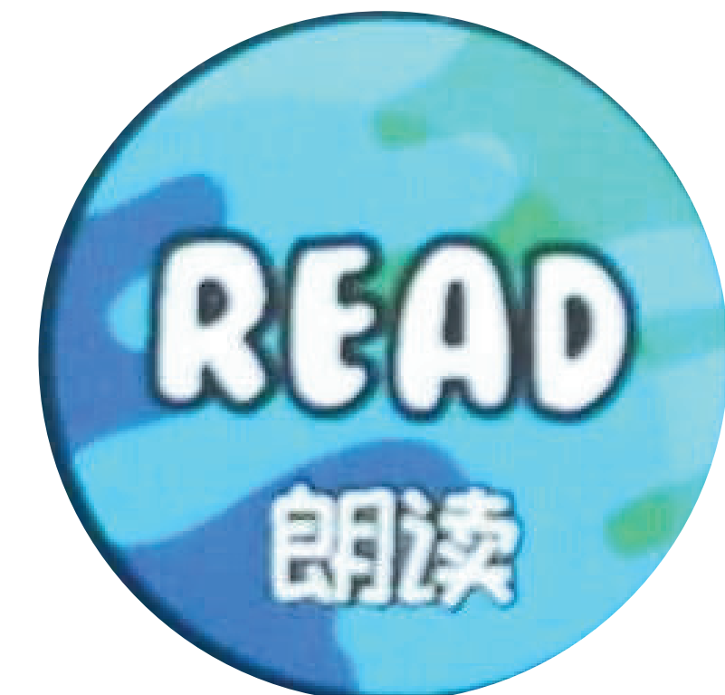
Auto-Reads all Words on the Page