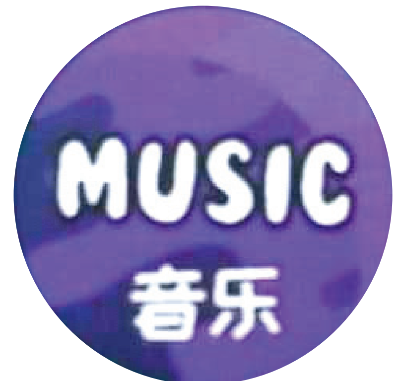
Play Music Tracks