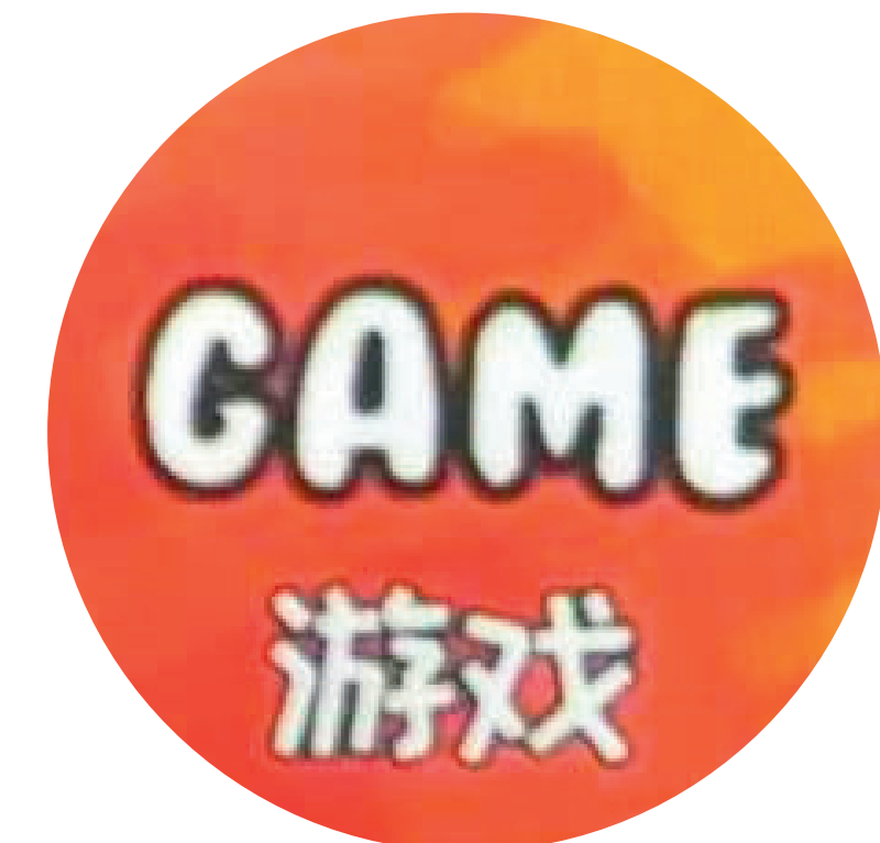
Question & Answer Mode