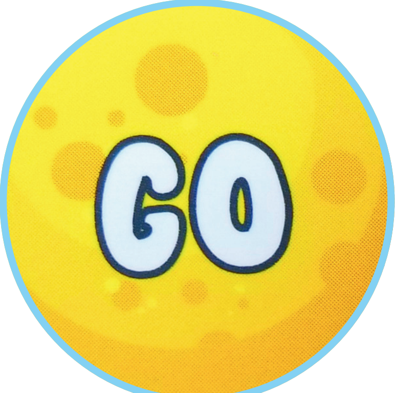
Activate the Page