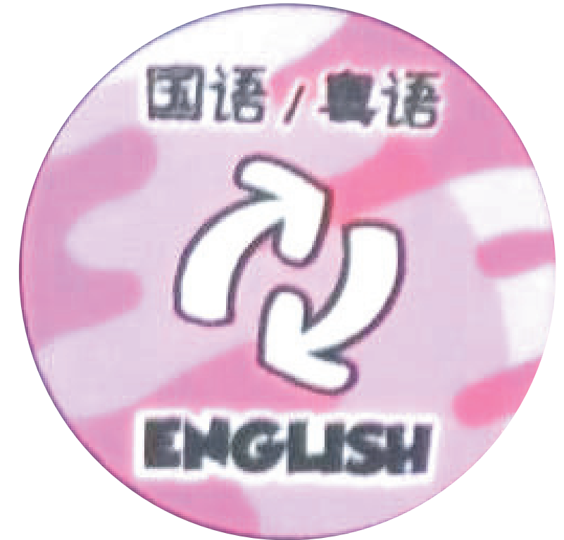
Switch Language to Chinese/English